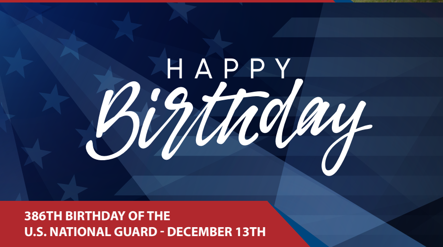
386TH BIRTHDAY OF THE U.S. NATIONAL GUARD - DECEMBER 13TH