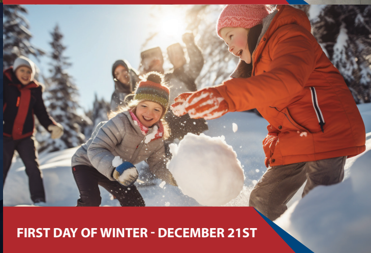
FIRST DAY OF WINTER - DECEMBER 21ST