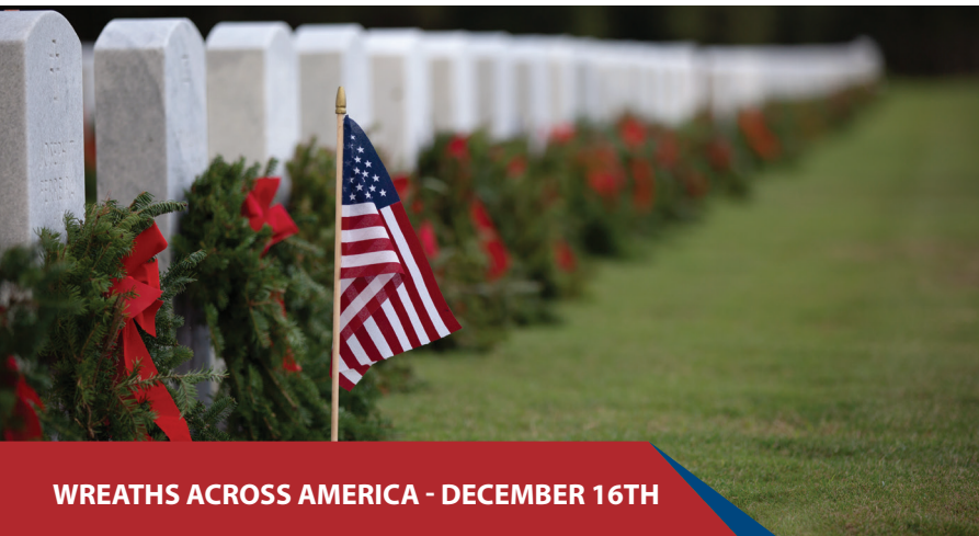
WREATHS ACROSS AMERICA - DECEMBER 16TH